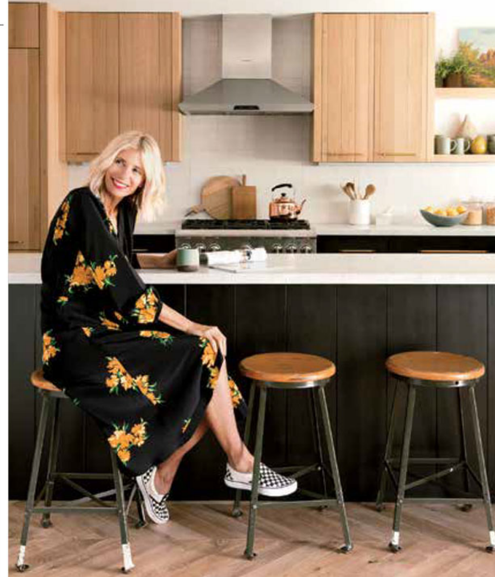
OPEN SHELVING PROVIDES A BREAK IN THE CABINETS AND AN OPPORTUNITY FOR A BURST OF COLOR VIA PLANTS, ART, AND POTTERY.

A bold wall mural, with its watercolor effect, and large light add dimension to the dining room. "I love to take one element in a room and really go outside standard sizing," she says. "It feels cool to see an oversize fixture stand out and take over as the artwork in the room." Soft Gray Watercolor Wall Mural , from $35; muralswallpaper.com . Large Dome Copper Pendant (similar) , $472; shadesoflight.com . Eames Wire Chair (DKR.0) , $593; dwr.com .