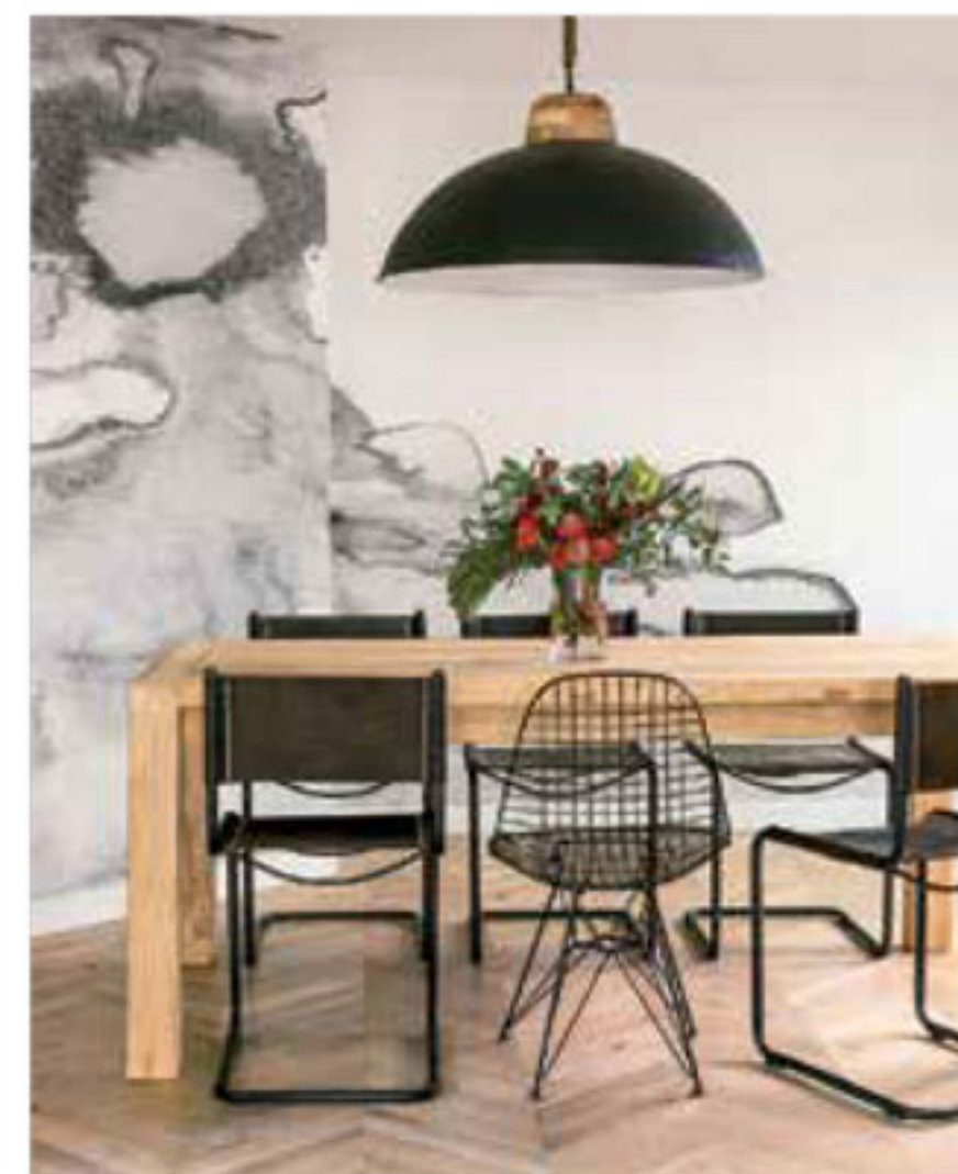
PROP STYLING: MERISA LIBBEY