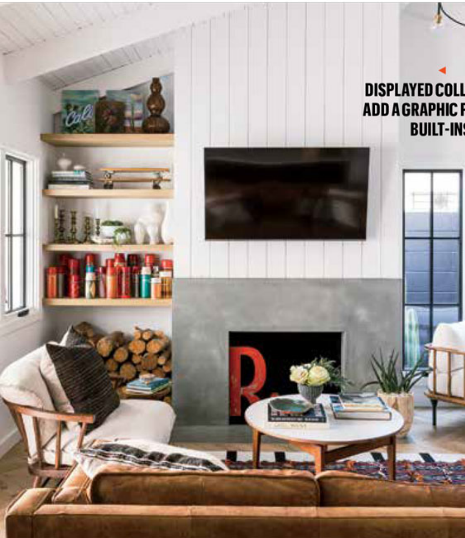
DISPLAYED COLLECTIONS ADD A GRAPHIC PUNCH TO BUILT-INS.