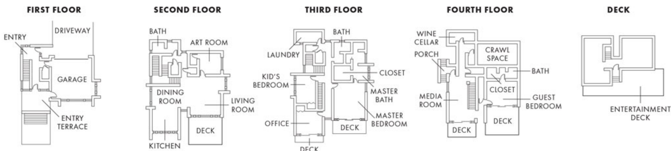
FLOOR PLAN: MARGARET SIOGAN