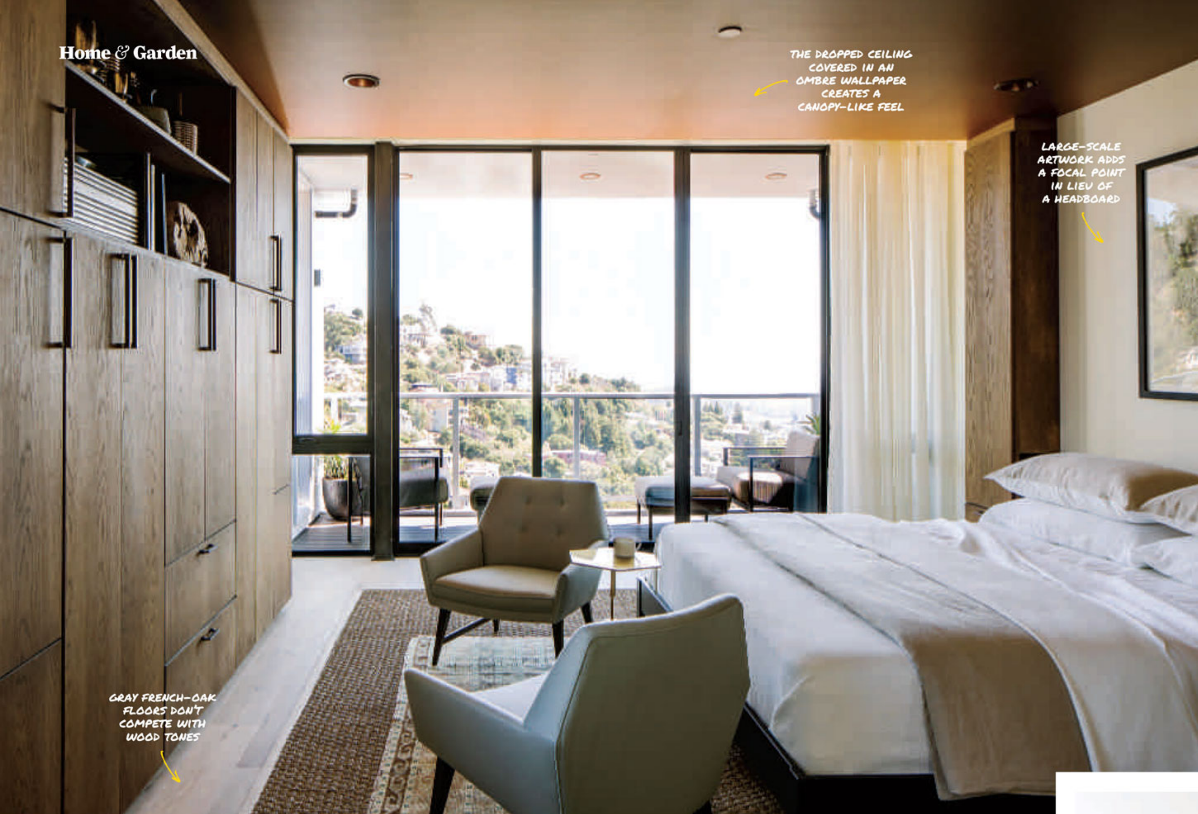
THE DROPPED CEILING COVERED IN AN OMBRE WALLPAPER CREATES A CANOPY-LIKE FEEL