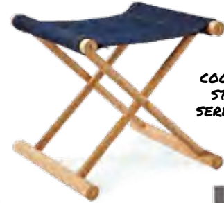
COOPER DENIM STOOL, $598; SERENAANDLILY.COM