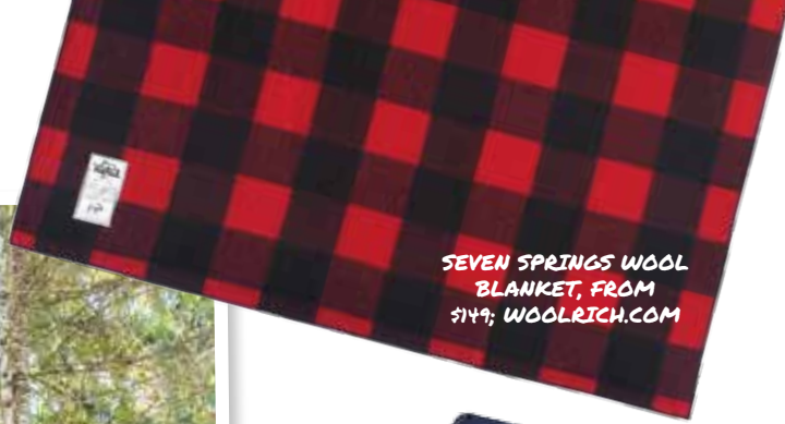
SEVEN SPRINGS WOOL BLANKET, FROM $149; WOOLRICH.COM